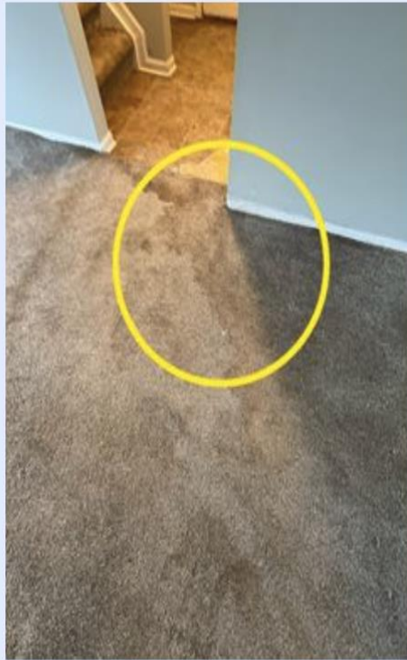
Carpet stains in basement