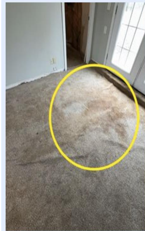
Carpet stains in basement