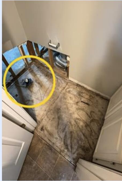
Lower level bathroom missing toilet