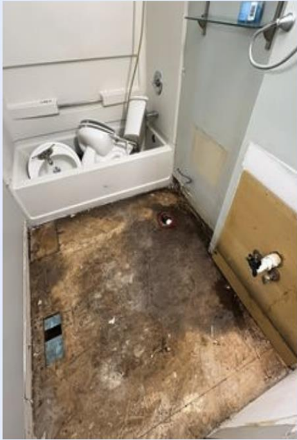
Main floor bathroom missing plumbing fixtures